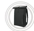
Lenovo IdeaPad Gaming Modern Backpack

* Example of Lenovo marketing catalogue naming convention