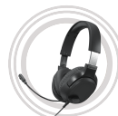
Lenovo Ideapad Gaming H100 Headset